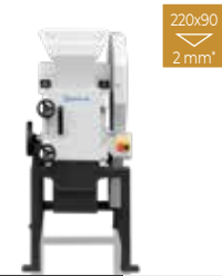
Jaw Crusher BB 400