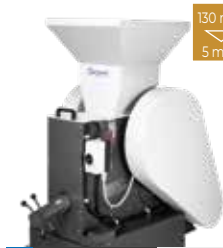
Jaw Crusher BB 300