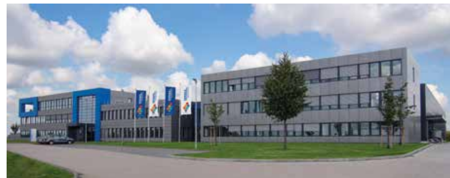
Retsch GmbH in Haan, Germany