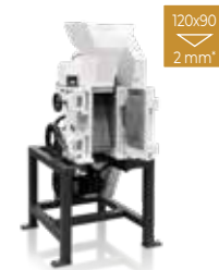
Jaw Crusher BB 250