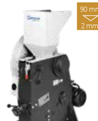
Jaw Crusher BB 200