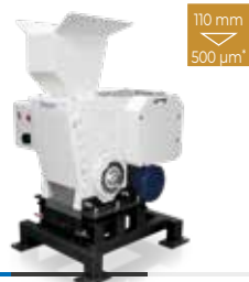
Jaw Crusher BB 500