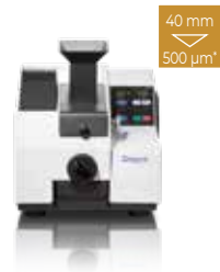
Jaw Crusher BB 50