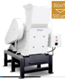
Jaw Crusher BB 600